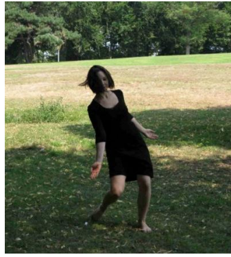
...and Gorgas dancing!